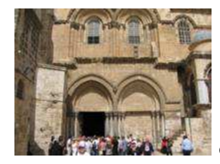
Church of the Holy Sepulchre

No where more than Israel is made manifest the damage caused by obstructing, with sectarian ritual, the living water of Christ's Holy Spirit. Here, in the land where Christ strode free and set free, restoring sight to the blind and healing the leper, divinity has been carved up and parceled out, controlled by the fiefdoms of various denominations. In the Church of the Nativity in Bethlehem, for example, three different denominations control different parts of the cathedral that shelters the birthplace of Christ. The sound of human laughter is forbidden inside the church – no kidding.