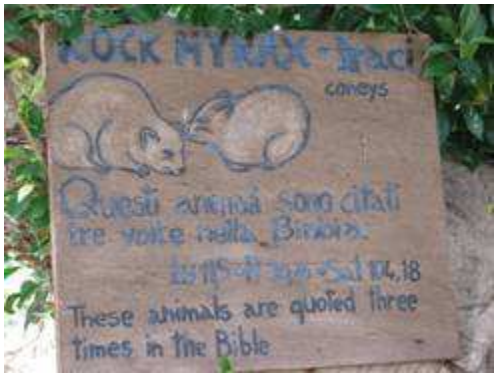
They did not preside at the city gate, judging who would be allowed to enter, and what the rules of the town would be. They were refugees, more like the hyrax described in Proverbs 30:26:

"The conies are but a feeble folk, yet make they their houses in the rocks"