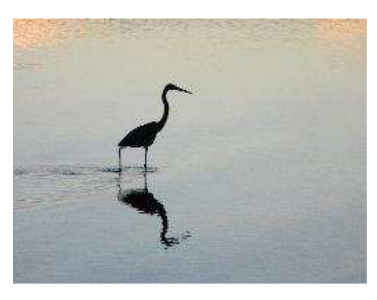
Mary Craig Ministries, Inc.