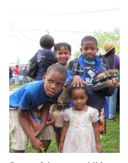
Some of the many children.