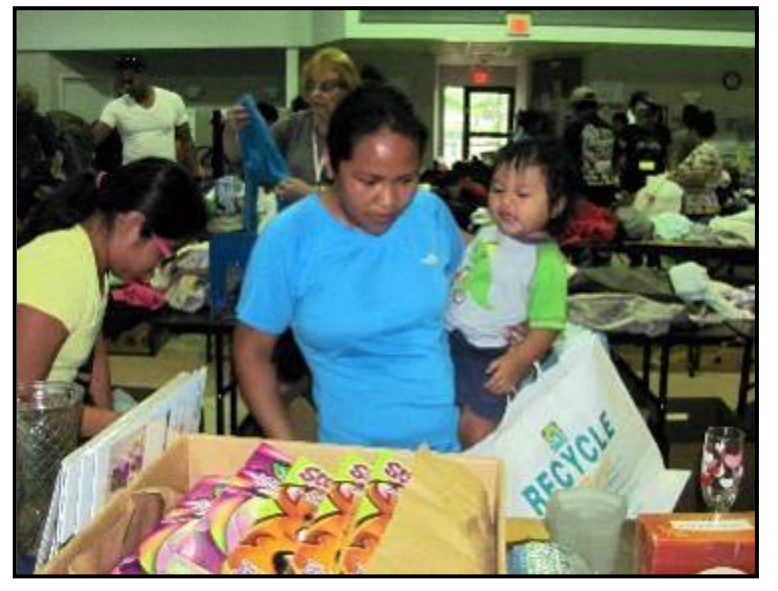
Oh, the possibilities.

Going, going... we go home, truck empty and hearts full.